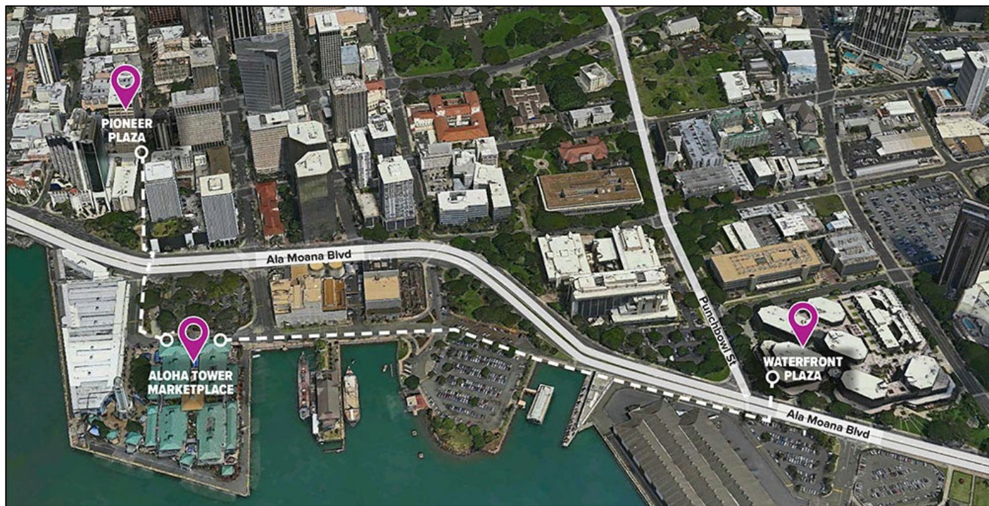
Downtown Campus map (Honolulu)