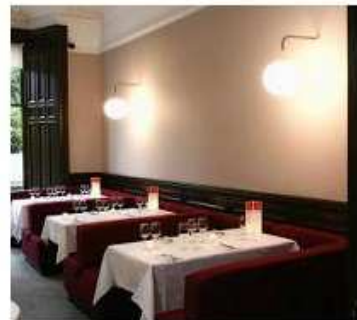
restaurant (Sample Card)